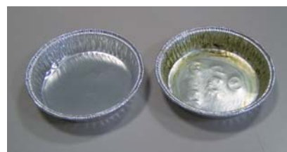
Special aluminum container The container on the right has oil remaining after drying

Prof. Kawano: To resolve our dilemma, A&D's sales reps came to the laboratory to help us. We were told it is important to create a stable measurement environment in order to increase the reproducibility of the weighing value, taking into consideration temperature, humidity and breezes from the air conditioner. The environment in the room where the balance is set up is essential for precise measurement. We found a room with little movement of air. Properly warming up the balance also helped our measurements. We wait 1 hour after turning on the balance before measuring.