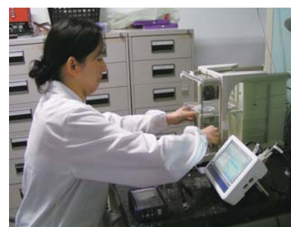
A&D BM-252 Analytical Balance and AD-1691 Weighing Environment Analyzer